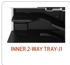
INNER 2-WAY TRAY-J1